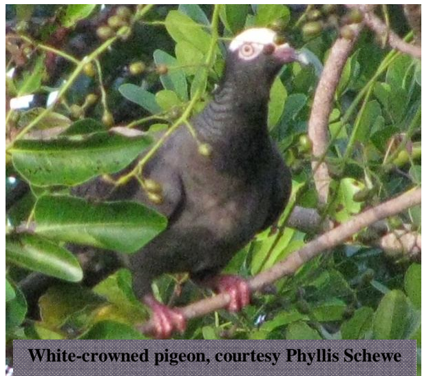
White-crowned pigeon

I pledge to protect and conserve the natural resources of the Planet Earth and promise to promote education so we may become caretakers of our air, water, forests, land and wildlife.