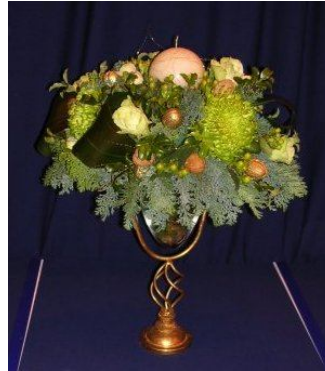
Christmas by Candlelight - A Mass Design

The December "Floral Design Newsletter" contained some holiday decorating tips and attractive designs. I thought some of our members would enjoy the designs.