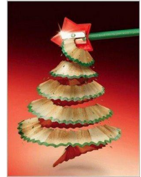
A Miniature Design created with pencil shavings