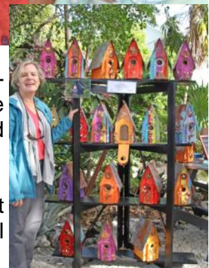
Right: One of our great vendors with her colorful bird houses.