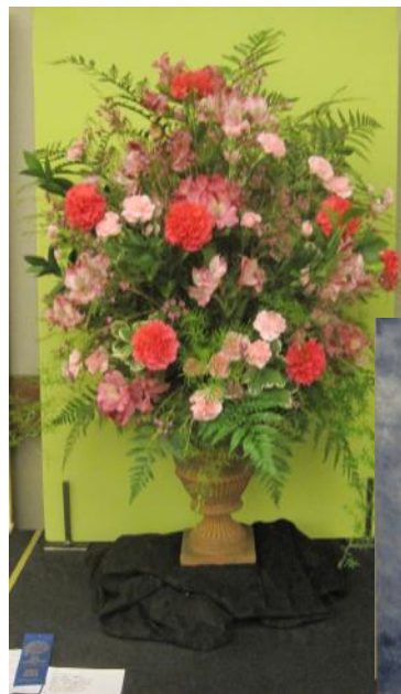
A Traditional Mass Design presentation "Remember"