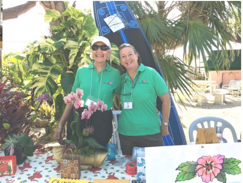
Left: Casey's Corner Nursery & Landscaping