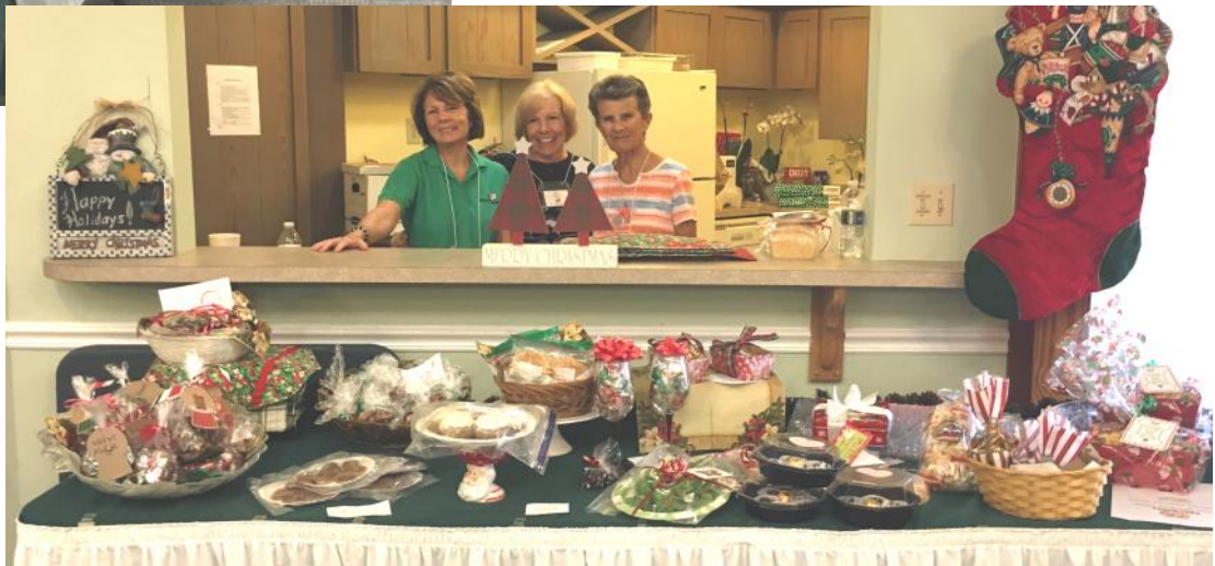
Below: Some of